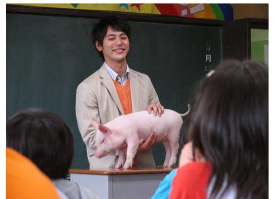
Still photo from the film, SCHOOL DAYS WITH A PIG

Reel 2 Real also offer hands-on animation workshops. Participants of all ages and abilities can create short animated films with paper cut-outs, clay, and pixilation. Everyone is welcome. Contact: volunteerassistant@mosaicbc.com to let us know that you are coming.